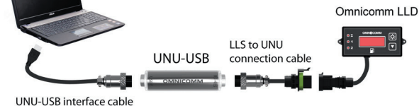
Figure 2. Omnicomm LLD to PC connection scheme with USB adapter Omnicomm UNU-USB