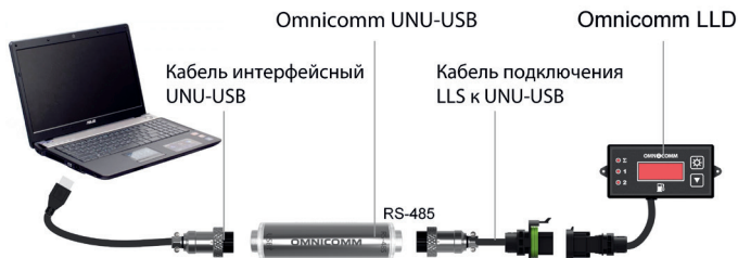
Рисунок 2. Схема подключения Omnicomm LLD к ПК с помощью UNU-USB